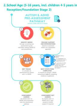
Figure 2: Somerset Autism and ADHD Pre-assessment Pathway

https://www.somerset.gov.uk/children-families-and-education/the-local-offer/education/autism-and-adhd-pathway/798147-2/